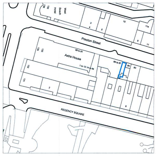
Scale in Metres 1:1250 +LP Location Map 1:1250